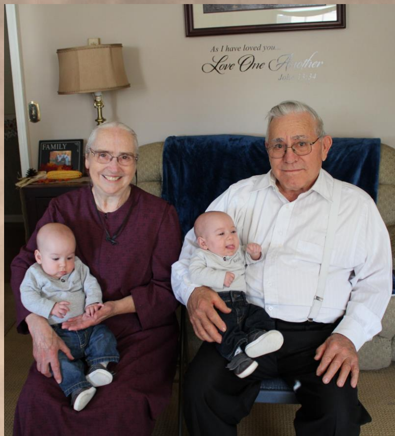
Born 1939 (2 days apart)